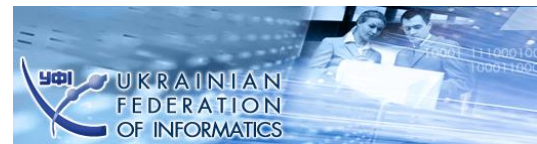
Ukrainian Federation of Informatics Ukraine